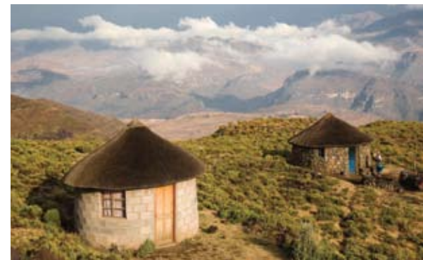
Small farm homes dot Lesotho's mountainous landscape.

In 1994 the young Basotho farmer got drunk at a local bar.